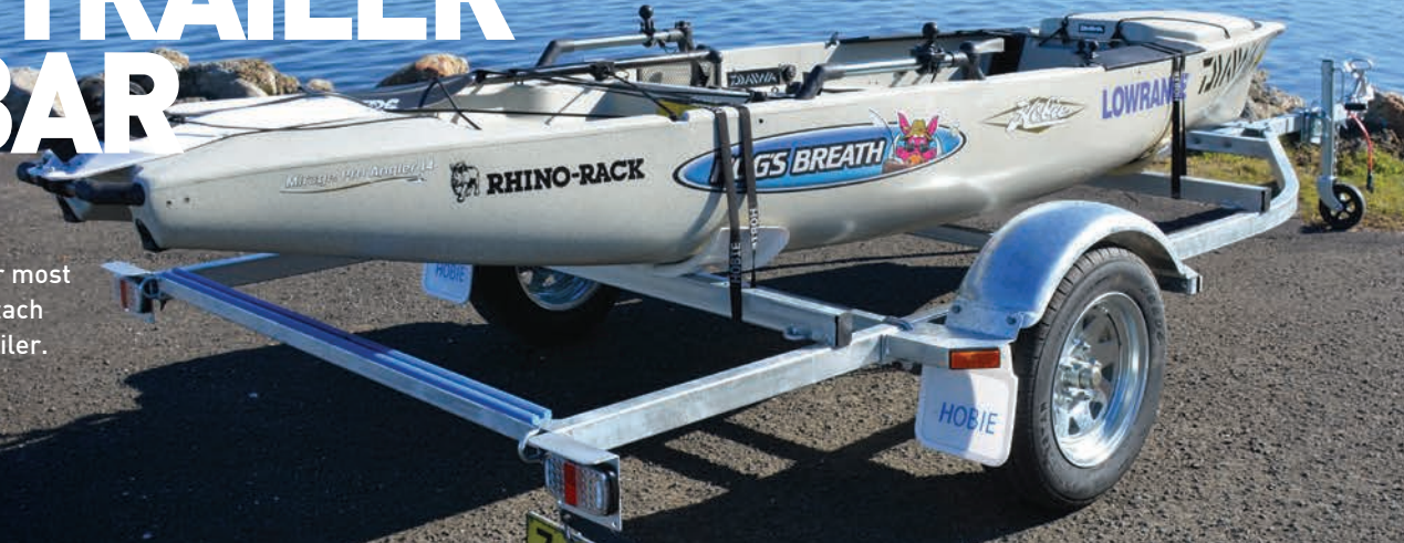
TR-HKT4.2M13SDB HOBIE KAYAK TRAILER AL4.2M 13 SHORT DBAR

The lightweight and compact Hobie short draw bar kayak trailer is ideal for most of the Hobie kayak range. Add the adjustable double stacker frame and attach the triple stacker bar and carry a host of Hobie kayaks on the one great trailer.